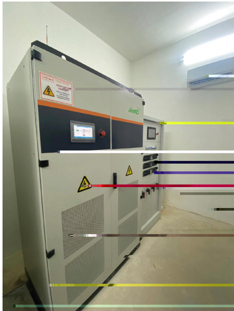
Figure 1: Project Photos