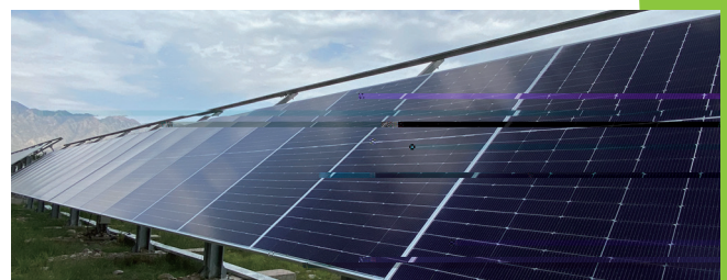
Figure 3. The project picture

Figure 3 shows the project picture of the solar panel installation in Yinchuan, Ningxia.